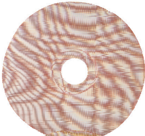
DIAMOND SCREEN RED 220 GRIT