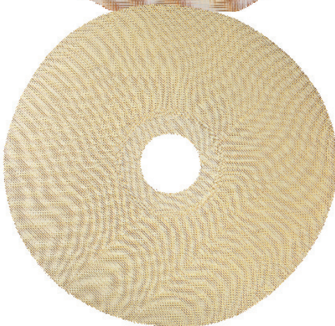
DIAMOND SCREEN GOLD 600 GRIT